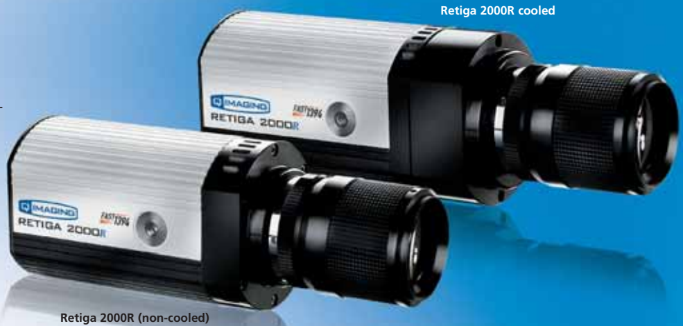
Retiga 2000R (non-cooled)

The QImaging Retiga 2000R digital camera features enhanced visible-range quantum efficiency resulting in high sensitivity that is ideal for brightfield, machine vision, metrology, and metallurgical imaging applications. A progressive-scan interline CCD sensor gives a resolution of 1.92 million pixels in a 12-bit digital output. High-speed, low-noise electronics provide linear digital data for rapid image capture. The IEEE 1394 FireWire™ digital interface allows ease of use and installation with a single wire. No framegrabber or external power supply is required. The Retiga 2000R includes QCapture software (Windows® and Mac OS) for real-time image preview and capture. A Software Development Kit (SDK) is available upon request for interfacing with custom software.